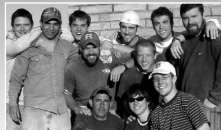
BAND OF BROTHERS. "By the end of the week, we were pretty tight, dude."

the center of all of our lives and reminded our hearts of the calling to assist our fellow man, as Jesus taught us, "...whatever you did for one of these least brothers of mine, you did for me" (Mt. 25:40).